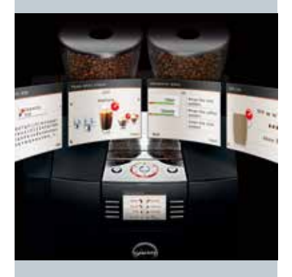
Customisable start screen