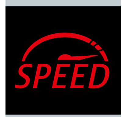
Speed function thanks to additional hot water bypass