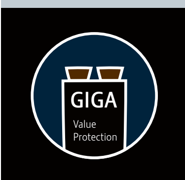
GIGA Value Protection